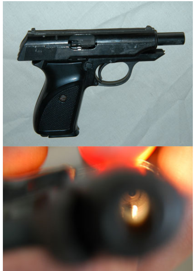
FIG. 2—Photographs showing one example of a modified blank cartridge gun and inside of the barrel in which the barrier had been discarded.

Ballistic examination of the guns involved in these cases was performed in the Criminal Laboratories of the Police Department and this examination revealed that the metal device inside the back of barrel that does not allow bullets to be inserted in the firing chamber had been removed. The examination of the cartridges also made it clear that some handmade spherical metals were inserted into the tip of the cartridges. In trial shots, all these guns were