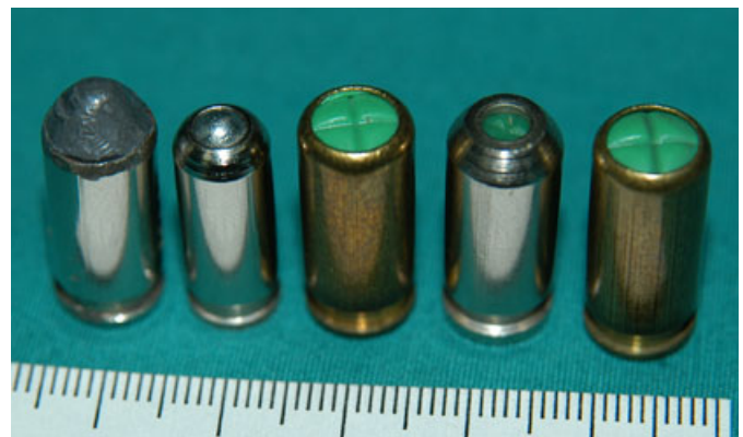
FIG. 3—Original, unmodified blank cartridges and modified blank cartridges to tip of which spherical metals had been inserted (first two on the left).

detected to discharge the metal spherical bullets successfully (Figs. 2 and 3).